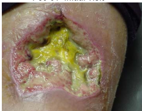
1-30-01 - initial visit